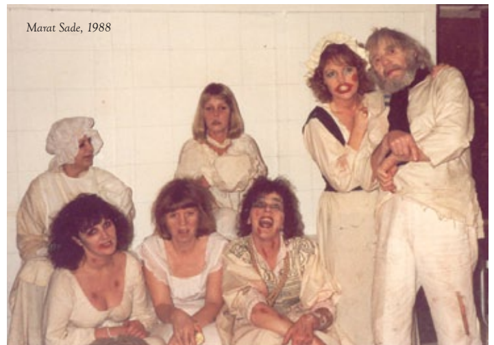
Marat Sade, 1988