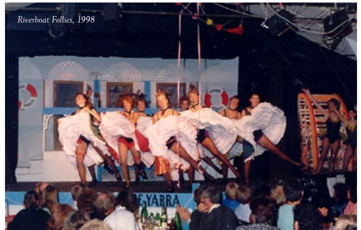
Riverboat Follies, 1998