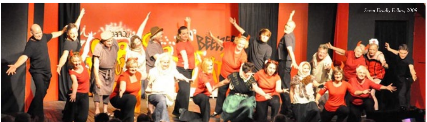
Seven Deadly Follies, 2009