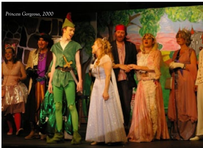
Princess Gorgeous, 2000