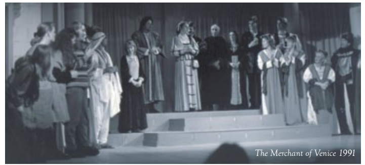
The Merchant of Venice 1991

Next up are the One Act Plays, which offer the extra experience of touring as a company around various Victorian OAP festivals. 2012 saw the successful establishment of the Youth Theatre which is promising even bigger and better things in 2013. A major Spring production generally completes the calendar, although pre-Christmas pantos have provided fun for young and old on a number of memorable occasions.