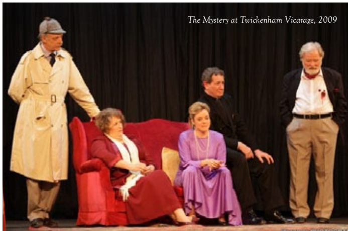
The Mystery at Twickenham Vicarage, 2009