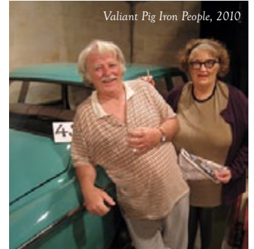
Valiant Pig Iron People, 2010