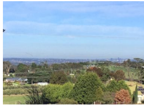
View from KG Lookout

There are a few people away at the moment and a few who will be going away in the near future. As our number is small we will need to 'hibernate' for the month of July. A few weeks ago, it was a lovely sunny day we decided to go outdoors, it turned out to be not a wise choice. We