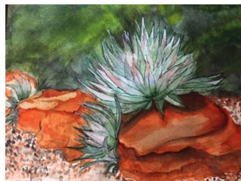
An indoor painting!

Two enquiries for new membership have been received, and both ladies turned up today to meet us and will return at a future date.