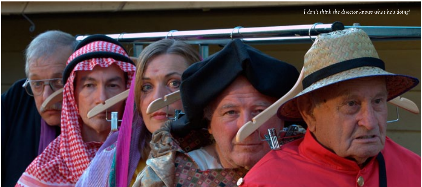
I don't think the director knows what he's doing!