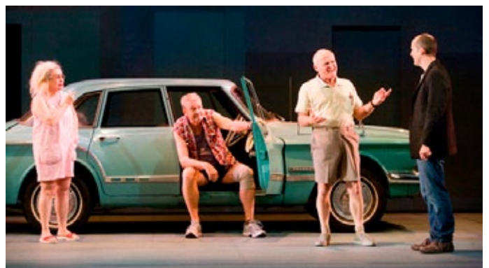
from Sydney Theatre Company's production of The Pig Iron People