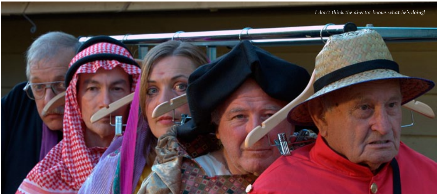
I don't think the director knows what he's doing!