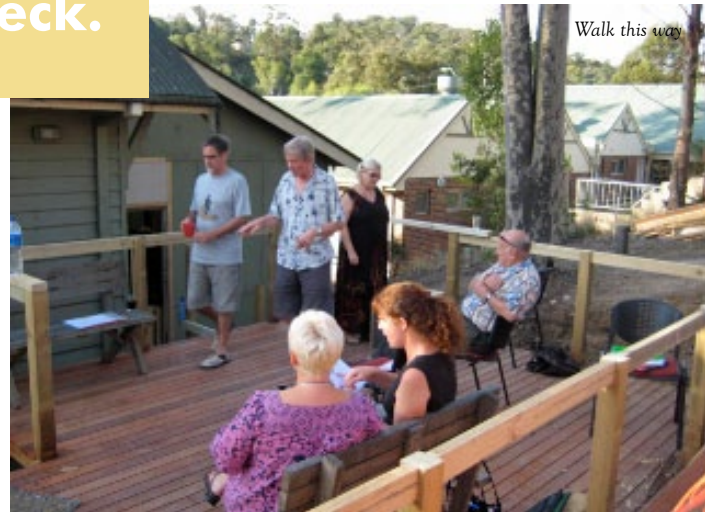
Walk this way